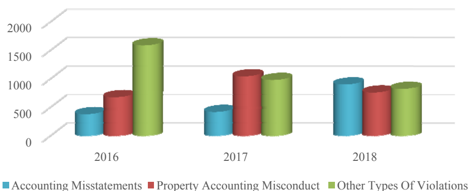
Figure 3 – Dynamics of the amounts of violations according to the results of the audit activities of the National Audit Office for 2016-2018. Note: compiled by the author based on the source [5]

Private experts and universities conduct external reviews of the Office reports and statements. A special structural unit of the SAI carries out internal expertise. Only 10% of the total number of control measures undergo examination by internal control.